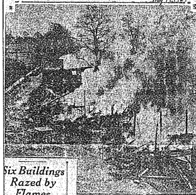
Six Buildings Razed by Flames